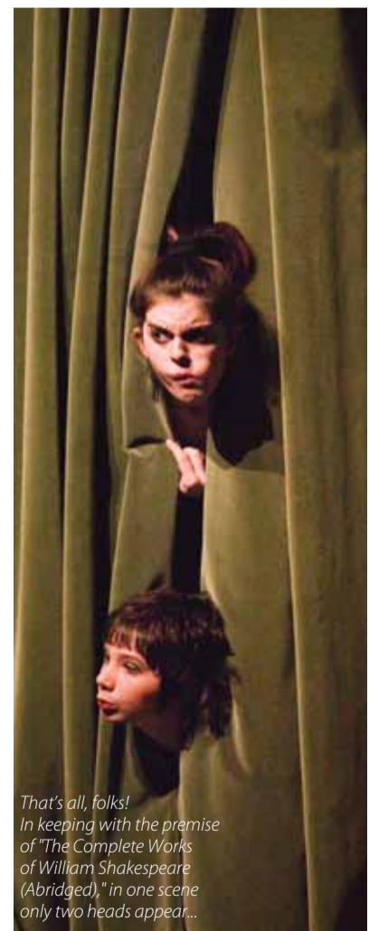
That's all, folks! In keeping with the premise of "The Complete Works of William Shakespeare (Abridged)," in one scene only two heads appear...