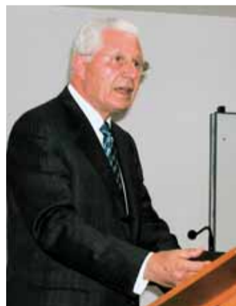
Ambassador Leonidas Evangelidis '53, formerly Director-General of Common Foreign and Security Policy in the European Commission, delivered a Dukakis Lecture on the European Constitution on May 17.