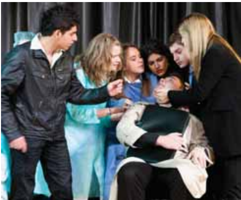
Scenes from the Drama Club's production of "Grease" (top) and the Greek Theater Club's staging of Dario Fo's "Claxons, Trumpets, and Raspberries."

annual Christmas Bazaar, held on Sunday December 13 in Ingle Hall, attracted a record 1500 paying visitors to coffee served by seniors and stands manned by faculty, students, and volunteers where one could buy everything from cakes and cookies made by junior high students (and their mothers) to a new puppy. The following day was the Christmas Concert, held at the Aristotle University Performance Hall downtown. In recent years this has grown into a multi-school and even multi-generational event, with participation by Anatolia Elementary, students and faculty from the junior and senior high school, and the Alumni Chorale. Proceeds go to the school's scholarship fund. The mood was festive, and the hall was filled.