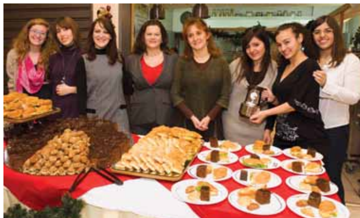
High school faculty, staff, and students ready to serve guests at the Christmas Bazaar.