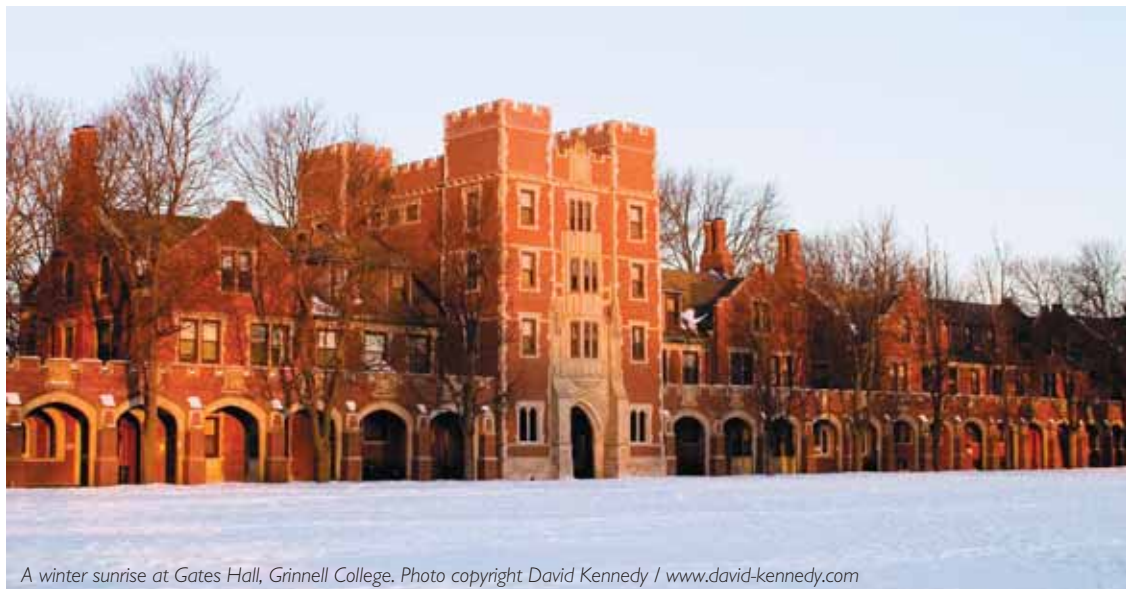
A winter sunrise at Gates Hall, Grinnell College.

PRST STD U.S. POSTAGE PAID PERMIT NO. 7 ASHLAND MA