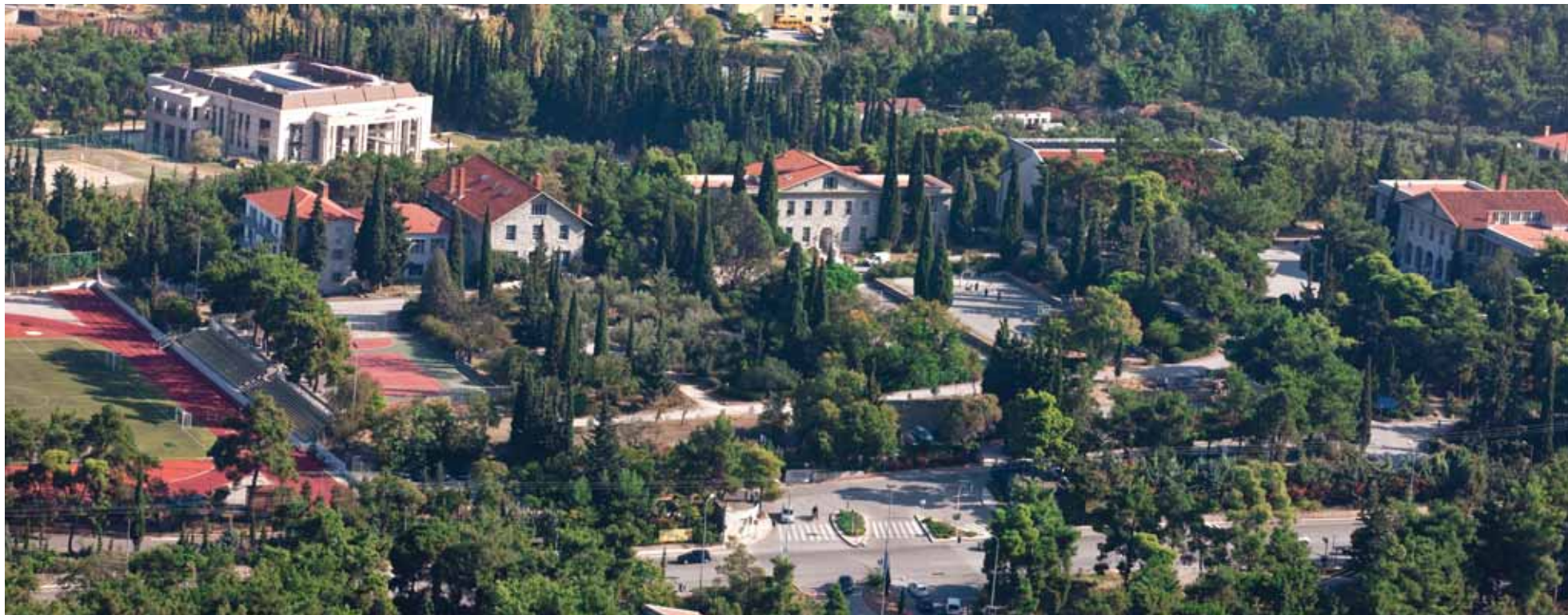
A view of the Anatolia and ACT campus showing the main entrance to the upper campus and the Bissell Library (left, background), Ladas and Compton Halls, Stephens Hall, and (at far right) Macedonia Hall.