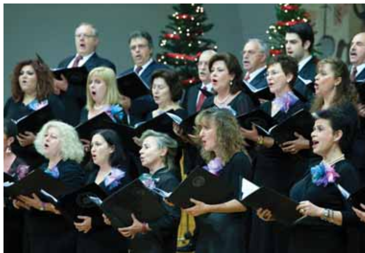
Lifting their voices in song at the Christmas Concert, Anatolia Elementary students, members of the Alumni Chorale, and singers from the High School.