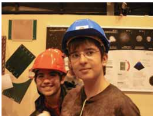
Hold onto your hats, those particles move fast... Anatolians spent part of their time at CERN underground, wearing safety gear.

There are thousands of people at CERN – from universities and collaborating institutions around the globe – who have been working on the LHC project over the past two decades, many Greek researchers among them. After the guided tour the students had the chance to visit Microcosm, an interactive multimedia display that explains