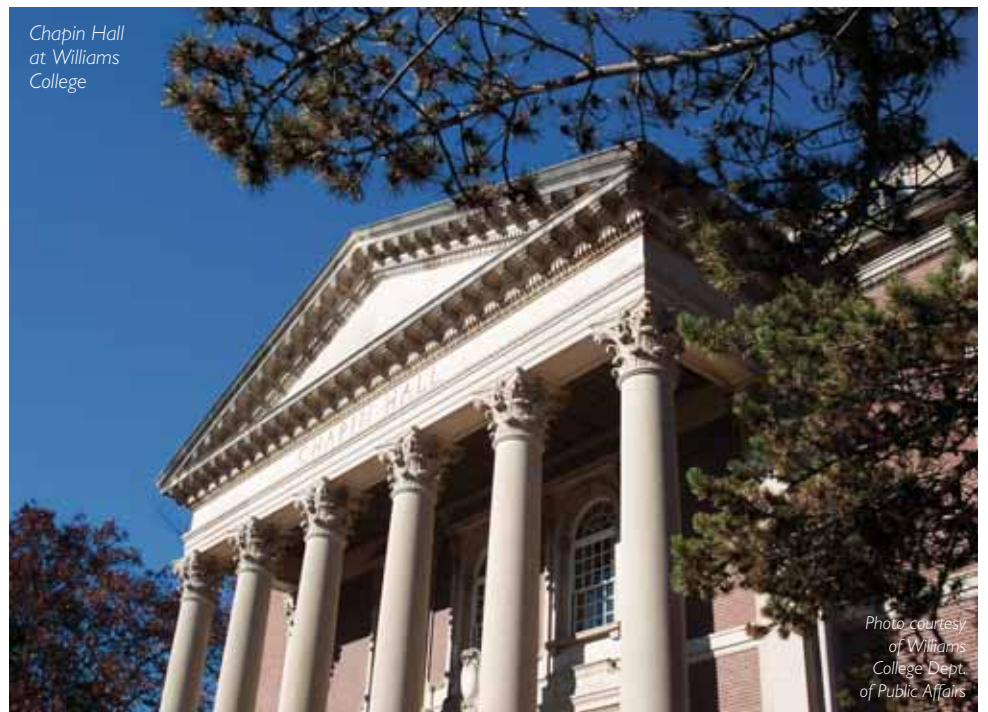
Chapin Hall at Williams College