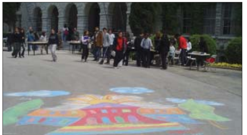
Club Happenings during Anatolia Week of the Arts