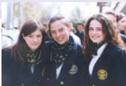
Anatolia lyceum students on parade in Thessaloniki on the 25th of March