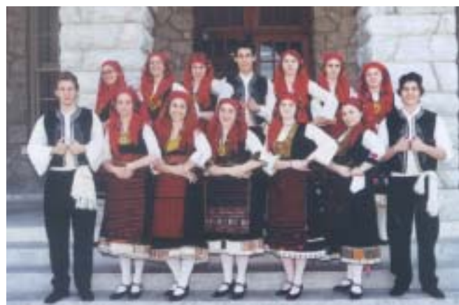
The Greek Dance Club on the steps of Macedonia Hall before their Field Day performance