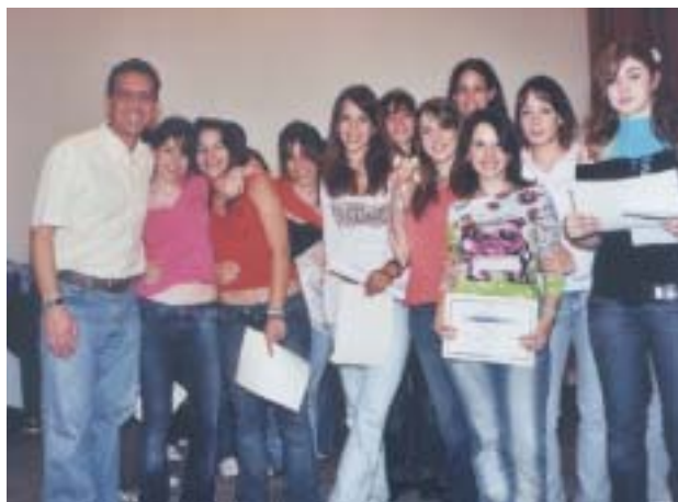
Choreography winners with certificates on Prize Day

"Field Day" is an Anatolia tradition stretching back more than 100 years. It involves foot races, tugs-of-war, choreography competitions, soccer, basketball, a performance by the Greek Dance Club, and more.