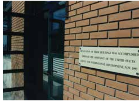
ACT New Building (1991, Anatolia archives)