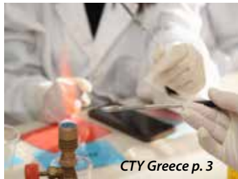
CTY Greece p. 3