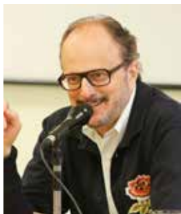
Jeffrey Eugenides on literature

Pulitzer-prize winning Greek-American author Jeffrey Eugenides paid a visit to campus and spoke to groups at the High School and ACT. At Anatolia High School, the author came face to face with the very group featured in many of his books—adolescents and young adults. When asked if he had any particular requirements in order to write, the creator of novels Middlesex , The Virgin Suicides , and The Marriage Plot declared, "The only thing I need is to be left alone with plenty of coffee!"