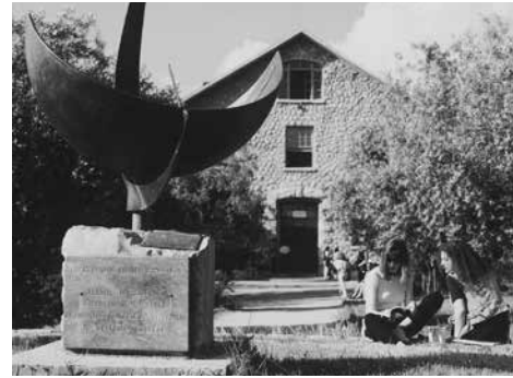
Compton Hall (1983)