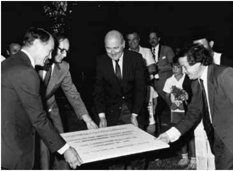
Eleftheriades Library (1987,)

A steadfast Anatolia College partner and supporter