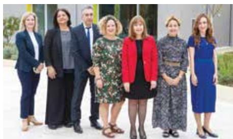
The Cassandra CEE Steering Committee

More information about the conference can be found at https://anatolia.edu.gr/el/21st-century-skills