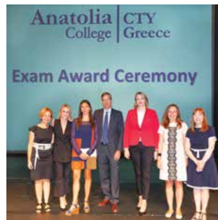
More than 1,000 people - students and family members - attended the Award Ceremony for CTY Greece on Sunday, September 22, 2019, at the "Hellenic World" Cultural Center in Athens.

underachievers, gifted and disadvantaged, and twice exceptional. It provides teachers with specialized tools and methodologies to identify, approach, and support talented students in their regular classrooms. The EGift platform is an Erasmus+ funded project developed by European academic institutions, including CTY Greece, with expertise in educating gifted students.