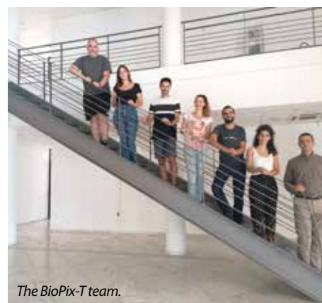
The BioPix-T team.