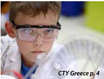
CTY Greece p. 4