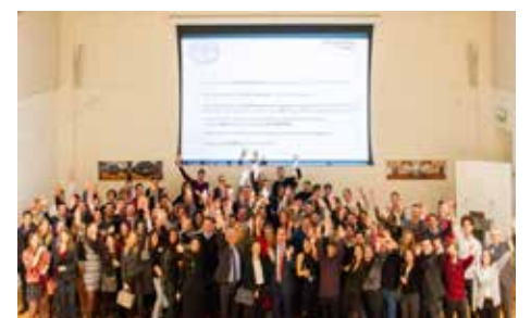
- London event

London Event: Over 120 Anatolia alumni enthusiastically attended an event at the Hellenic Center in London in January 2020. It is this lifelong enthusiasm demonstrated by our alumni that makes the broader Anatolia community so special and intrinsic to our school's identity.